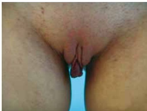
Figure 6 – Case report: type III change.