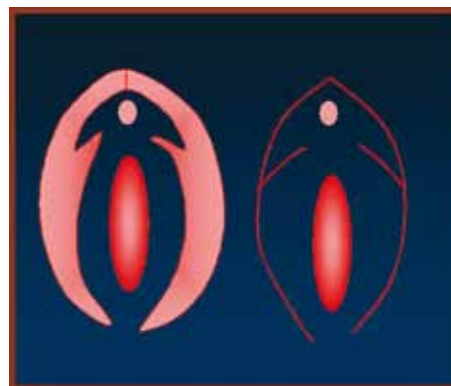
Figure 3 – Schematic representation of type III hypertrophy of the labia minora.