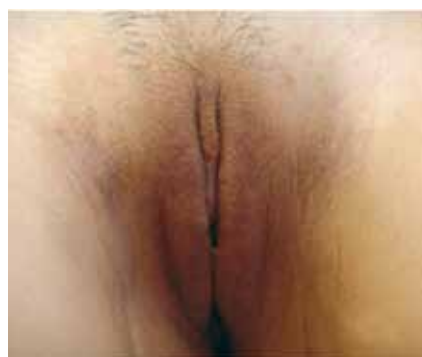
Figure 8 – Postoperative period in patients with type II hypertrophy of the labia minora.