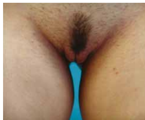
Figure 9 – Postoperative period in patients with type III hypertrophy of the labia minora.

maturity, a higher degree of information, and the search for a better body image that is characteristic of patients in this age group. The current technical refinements for this procedure, the improvement in the results of surgery, and the breaking of taboos are expected to result in a greater number of patients seeking labia reduction surgery at a younger age.