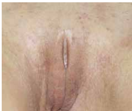
Figure 7 – Postoperative period in patients with type I hypertrophy of the labia minora.