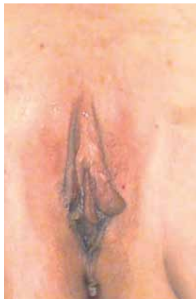
Figure 4 – Case report: type I change.

The greater average age of patients that seek surgical correction for labial hypertrophy is a reflection of sexual