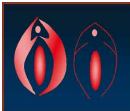
Figure 2 – Schematic representation of type II hypertrophy of the labia minora.